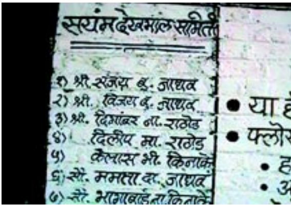
Committee formed by NGOs for maintenance of the unit.