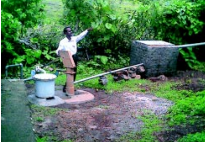
Rooftop rainwater harvesting at Tondsure.

Whereas IEI supplied the technology to solve the problem of iron contamination at Tondsure, the Rotary