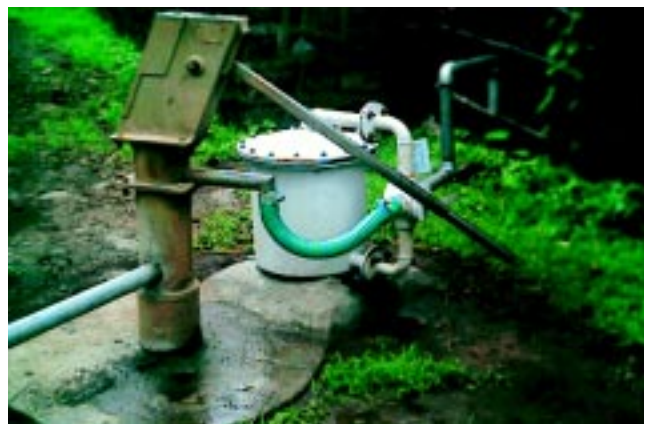
INDION Handpump Attachment for Iron Removal installed at Tondsure.

We recommended our INDION Handpump Attachment for Iron Removal, designed specially for rural India and using iron specific resin developed by our R&D. The