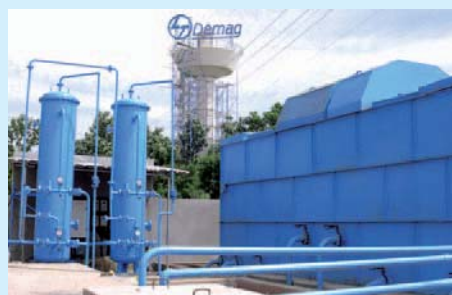
New generation packaged sewage treatment plant (NGPSTP)

in small housing complexes, compact sewage treatment plants are more suited.