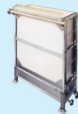
Membrane bio-reactor module

Here, while the capital cost is lower, the quality of treated sewage is not as good as that obtained with the MBR system. The recycled water is suitable for low end purposes such as flushing, gardening and in some cases, even as cooling tower makeup, after appropriate tertiary treatment. For treatment of smaller quantities of sewage such as