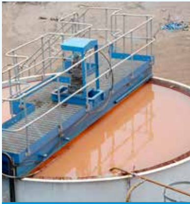
Iron Ore Thickener