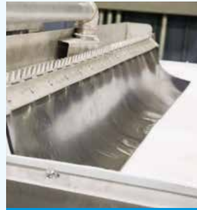
Belt Press for Iron Ore Slurry

Flocculants & Coagulants for Thickeners/ Belt Press: Enhances recovery and improves solid liquid separation