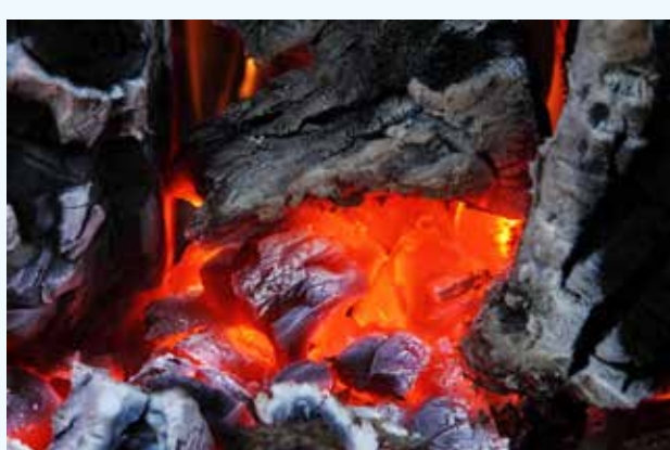
FA for Coal

Antioxidant: Minimizes/eliminates hot spots & spontaneous combustion during storage in stock yards without degrading GHV/GCV