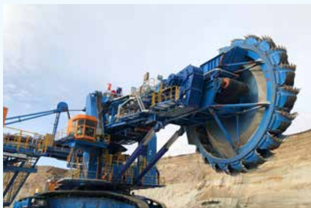
Coal Bucket Wheel Excavator

Tailing Management Of Ores: Effectively recovers water & extends life of tailing storage facility