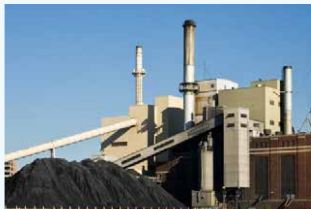
Lose Coal - Free Movement

Coal Flow Aid for Wet coal in CHP: Improves the uninterrupted coal flow to bunkers during the rainy season.