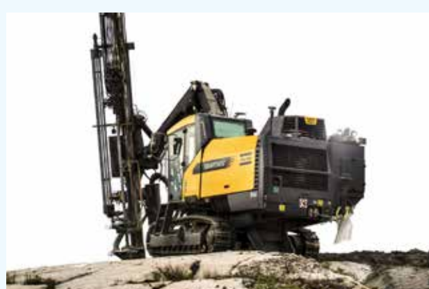
Diesel Fuel additive for Heavy Earth Moving Equipment

Fuel Additives: Diesel, bagasse, coal & furnace oil for better fuel mileage /performance, less maintenance and for a cleaner & healthy engine.