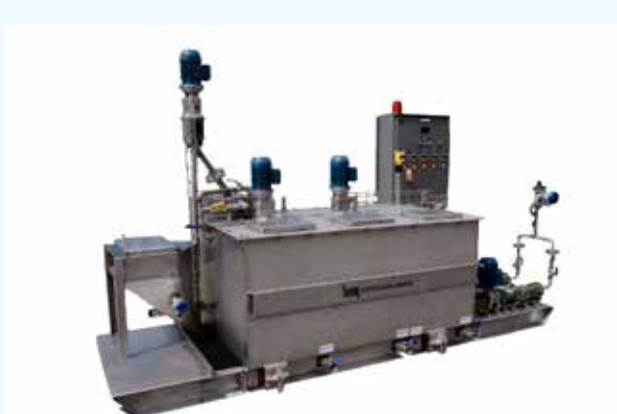
Foam in Mineral Process

Foam Control: Range of defoamers and anti-foaming agents help improve throughput, productivity & overall profitability.