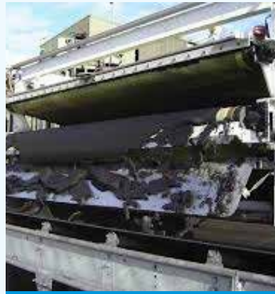
Belt Press for Coal Slurry