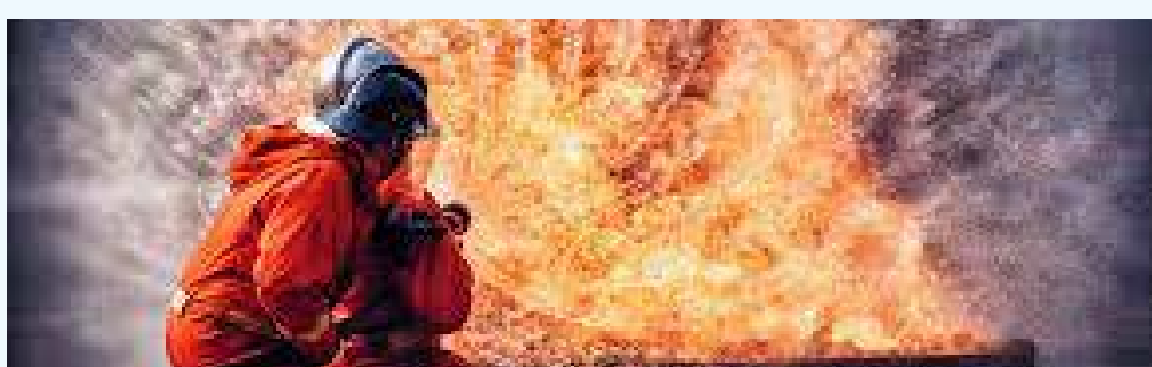
Without AO- Manual Stopping of Fire

Coal Flow Aid for Wet coal in CHP: Improves the uninterrupted coal flow to bunkers during the rainy season.