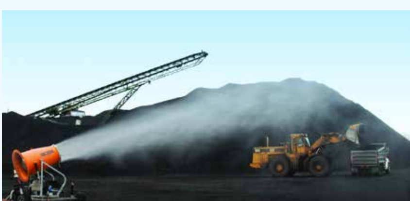
Dust Suppressant on Coal Pile

Collector & Frother: Enhances recovery & reduces froth carryover to downstream