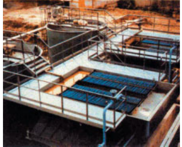
Installation in India of 2 x 100% lamella clarifiers with flocculation tanks. Each clarifier is rated for a maximum flow of 240 m 3 /h

Laboratory & pilot plant capabilities and trained technical experts ensure the optimum size of lamella clarifier to suit your requirements.